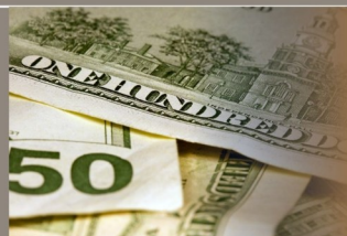
EXHIBIT HALL CASH PRIZE

12:30pm | Exhibit Hall 2 | Registration Desk Visit and collect exhibitor stamps for a chance to win cash prizes!