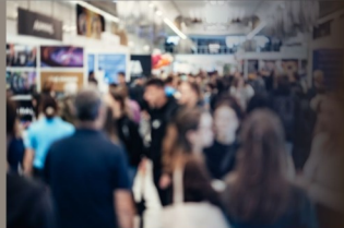
EXHIBIT HALL RECEPTION

3:00pm-5:00pm | Exhibit Hall 2 Join us in the exhibit hall for relaxed, face-to-face time with exhibitors. Discover their latest products and services while enjoying light appetizers and beverages and earn 5 hrs. Clinical-Exhibits credit.