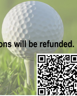
EXHIBIT HALL RECEPTION

Thursday, May 15, 2025 | 3:00-5:00pm The Monument, Rushmore Hall 1-3 5 hrs. Clinical-Exhibit CE