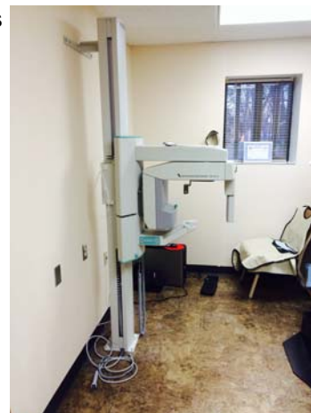
Panoramic X-Ray Machine donated by Henry Schein